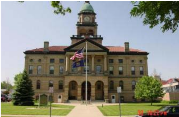
Photo: Van Buren County Courthouse

The total cost of the present Courthouse and the old Jail (described below) was $120,000. In 1999, the Courthouse restructuring and repair project was completed. The upper and lower domes of the Courthouse had to be removed from the top of the building, and the project was completed at a cost of $249,654.